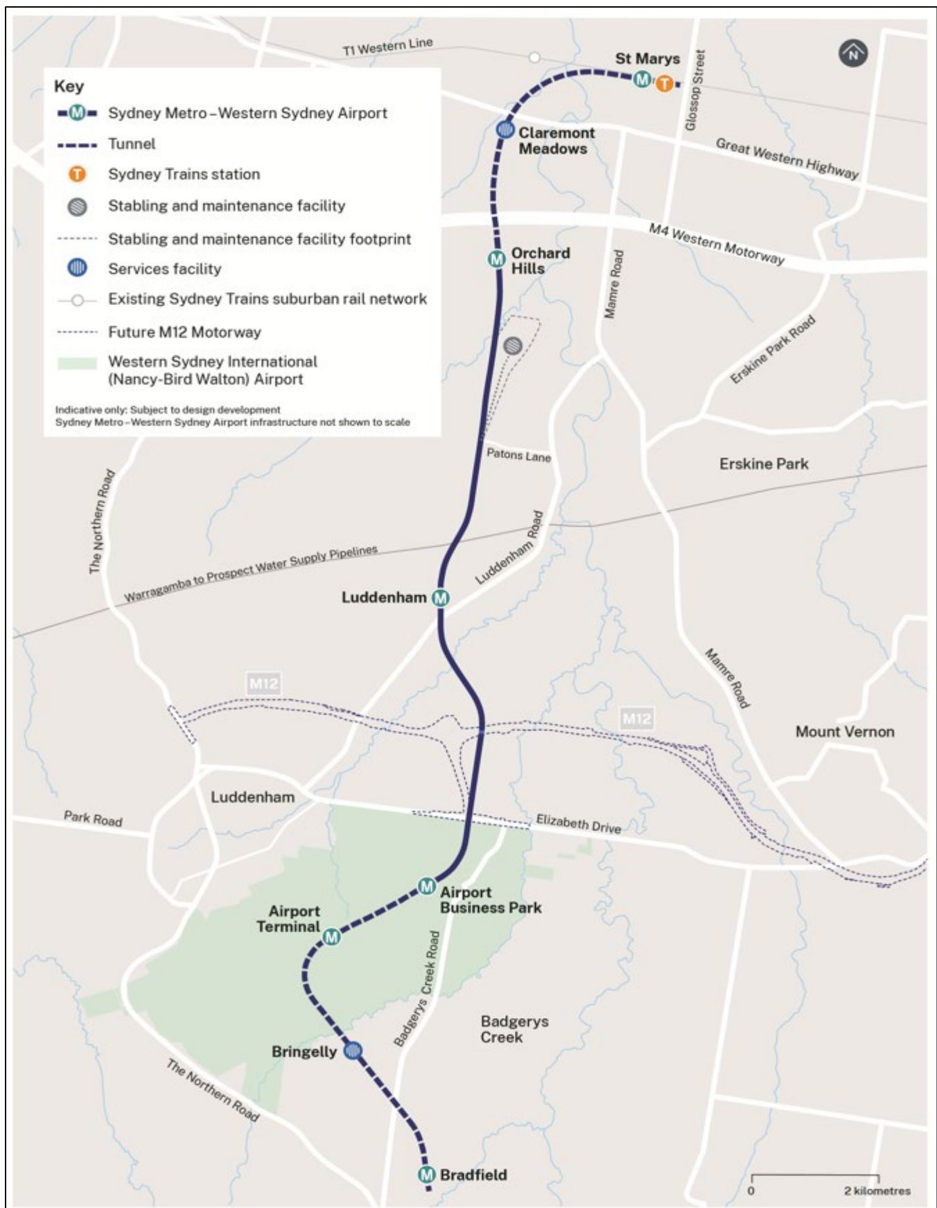
FIGURE 1. MAP OF THE SM-WSA PROJECT ALIGNMENT, AND STATION LOCATIONS